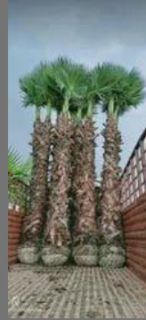
Green Washingtonia Palm Plant