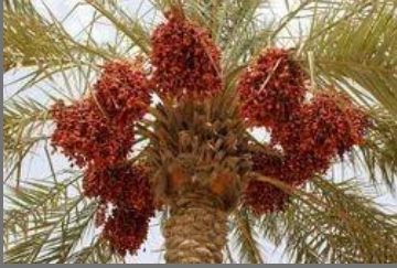
Date Palm Trees