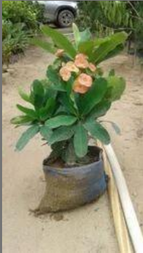
Oxygreenplant Euphorbia Plant