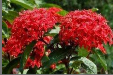
Red Ixora Flower Plant