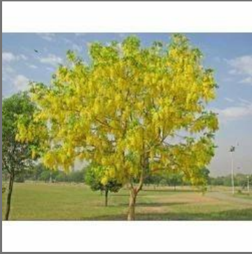
Amaltas Outdoor Plant