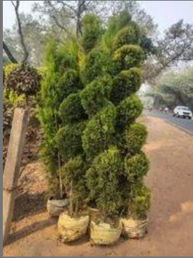
Green Cypress Plant