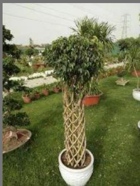
Ficus Benjamina Cage Plants