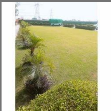
Natural Green Playground Lawn Grass