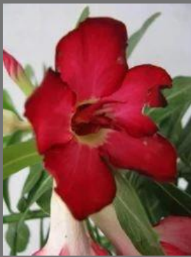
Adenium Dessert Rose Flower Plant