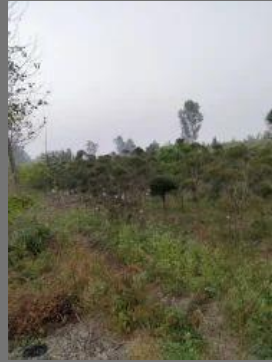
Casuarina Garden Plants