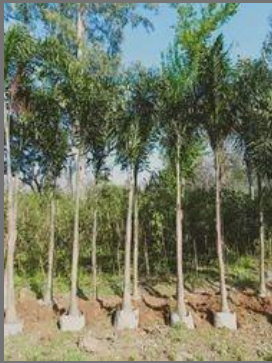
Foxtail Palm Tree Plant